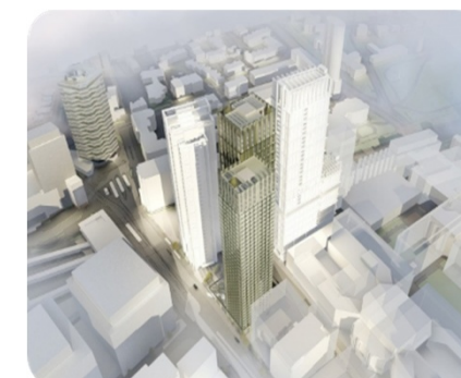
Construction of world's tallest modular residential building