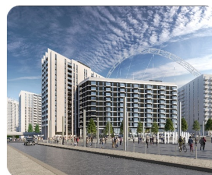
Construction of W03, adjacent to Wembley Stadium