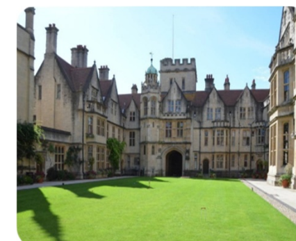
Refurbishment of Oxford's finest historic buildings