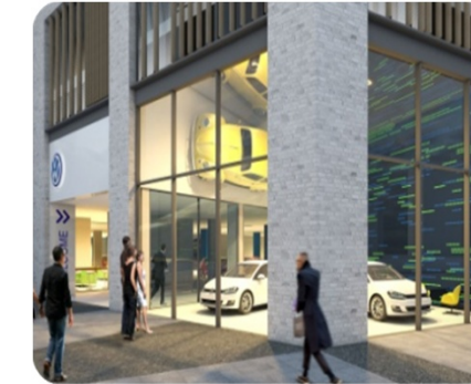
Mixed use developments providing retail, commercial, residential space