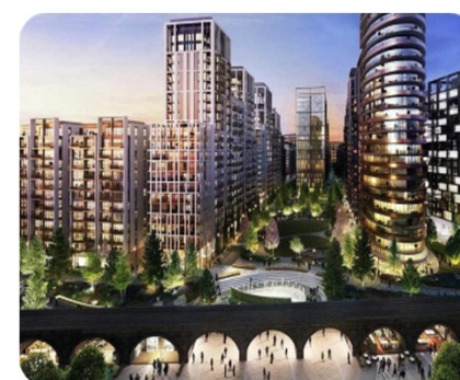
Redevelopment of White City West London

Some examples of the outstanding projects that we have been involved with more new and exciting projects being added to our portfolio all the time: