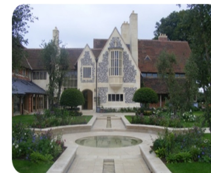
Design of Outstanding Luxury Homes